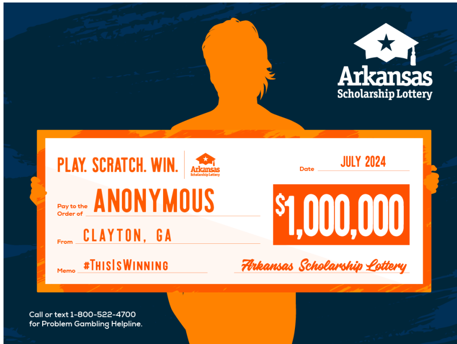
An anonymous Clayton, Georgia resident won $1 million playing $1,000,000 VIP Club.