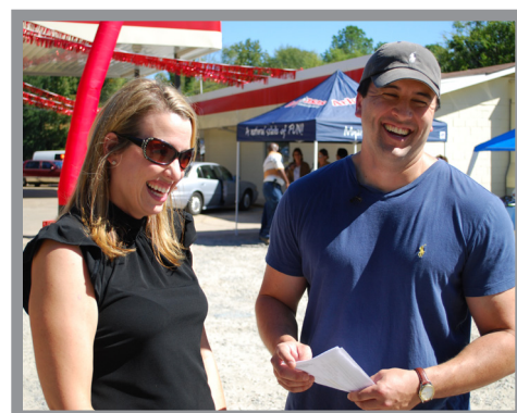
(THE BIG INTERVIEW)