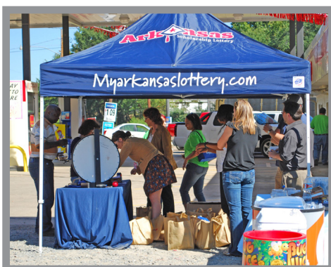
(ASL PROMOTION AT THE PIT STOP)